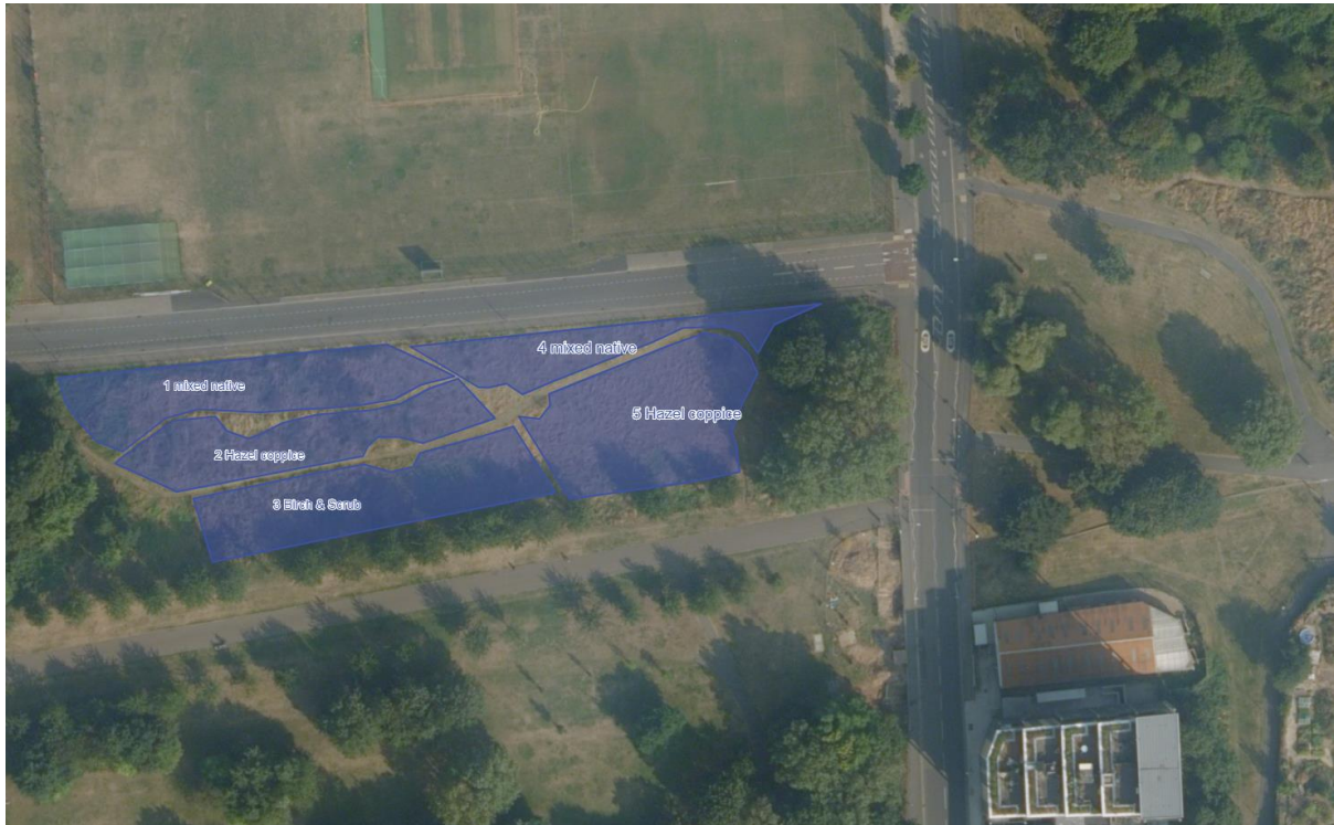
Proposed new woodland plan

Woodland area 1 Mixed native 750m 2 = 500 trees