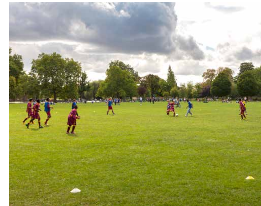
Existing grass pitches