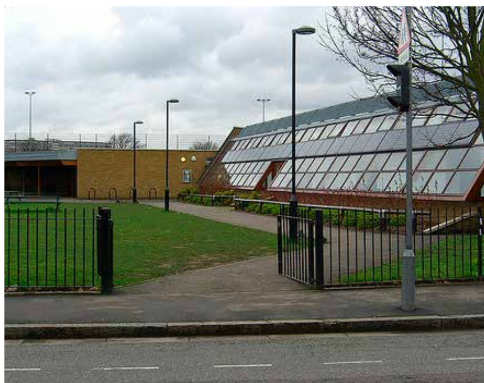
Existing Sports Centre building