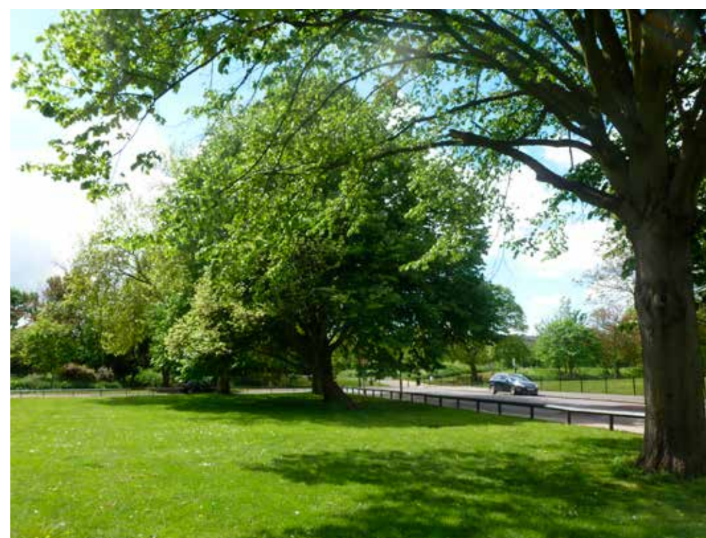
Existing trees on Cobourg Road