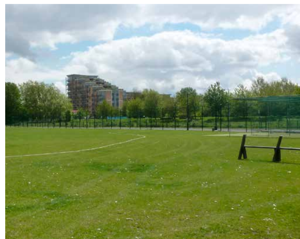
Existing grass pitches