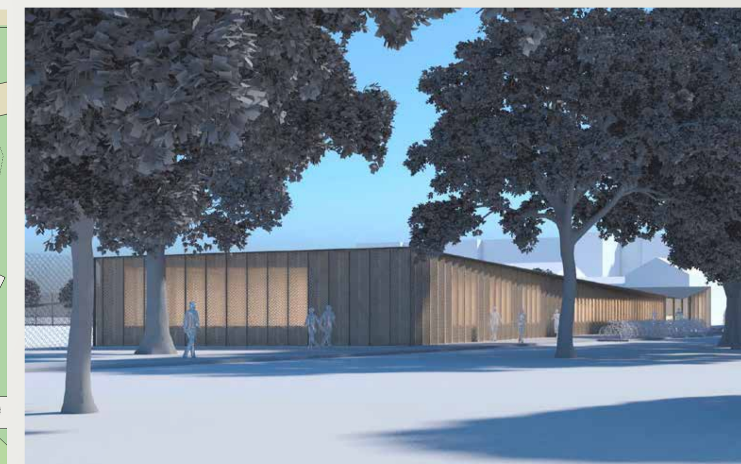
Indicative building visualisation