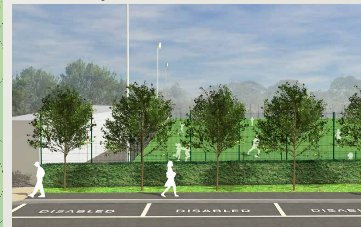
View looking south from a first floor window on Loncroft road