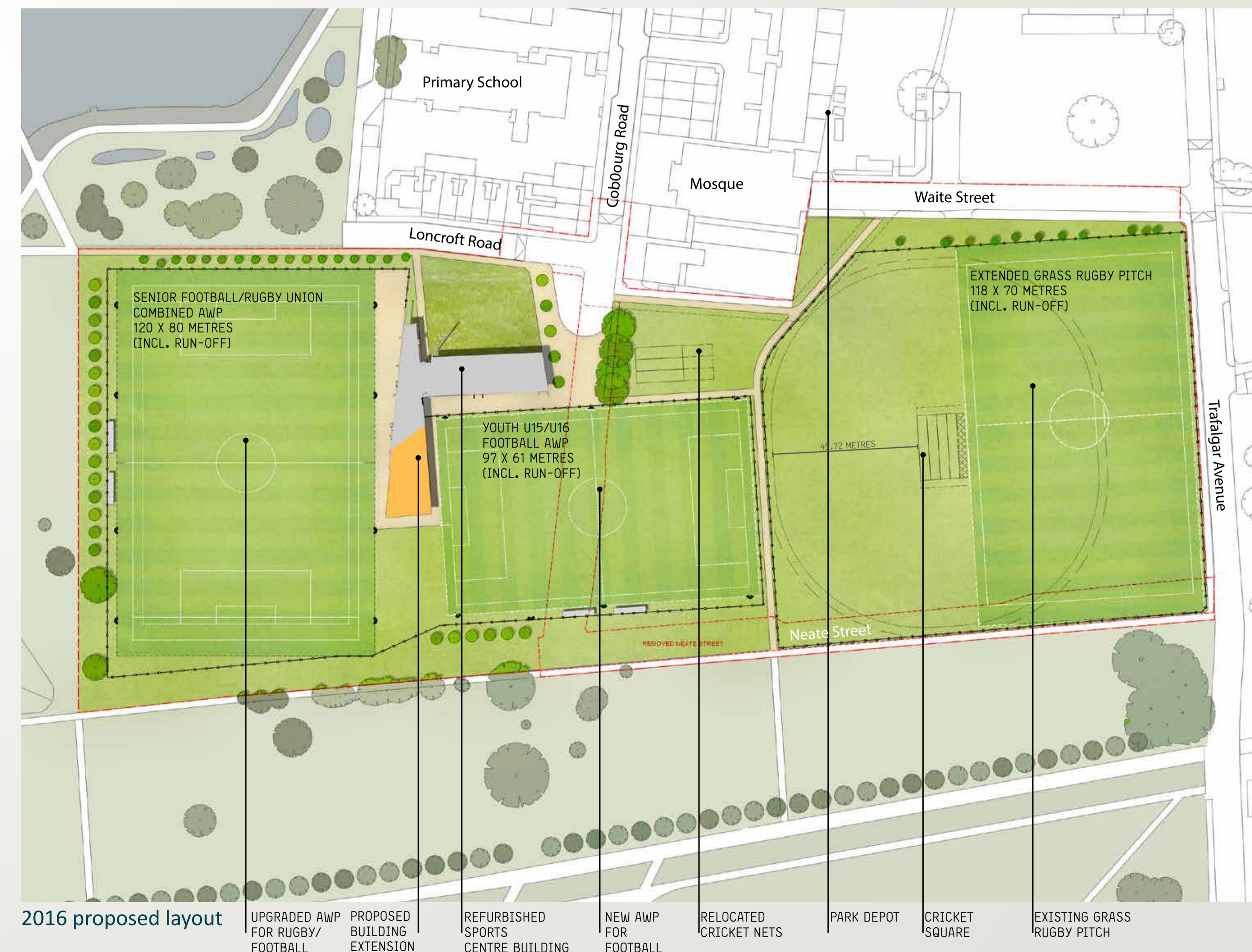
2016 proposed layout