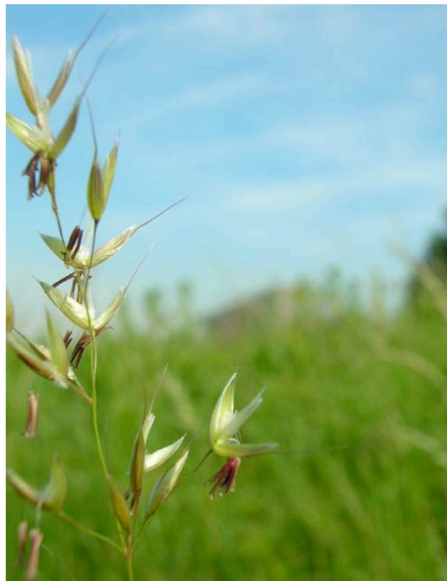
False oat grass ~ Arrhenatherum elatius