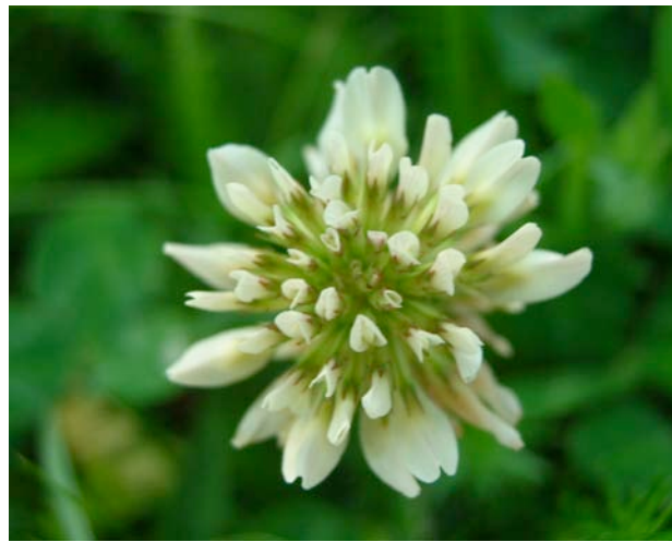
White clover ~ Trifolium repens